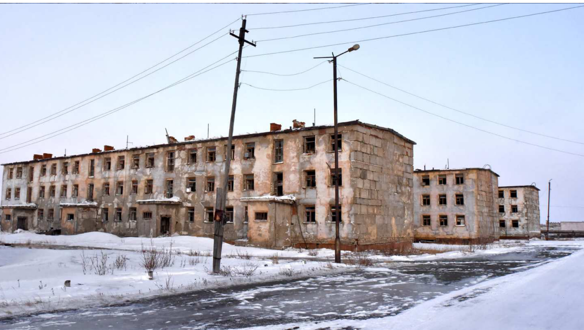
Ugolnye Kopi – a Post-Soviet Ghost Town in Chukotka