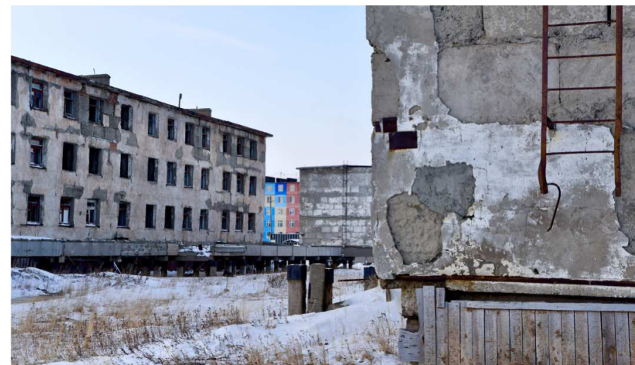
Ugolnye Kopi – a Post-Soviet Ghost Town in Chukotka