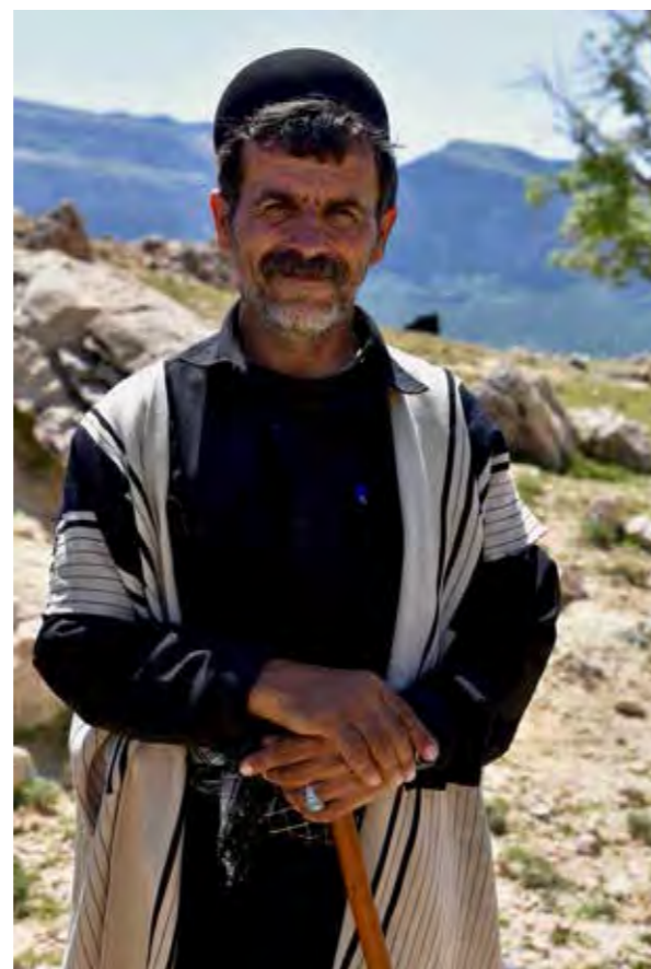
Previous pages: The Bakhtiari's gaze wanders over the fertile valley bordered by the snow covered Zagros Mountains

were the first Westerners to accompany the Bakhtiari on their human and animal-challenging migration. In 1976, more than fifty years later, Anthony Howarth's documentary “People of the Wind” showed a virtually unchanged image of the arduous kuč, only