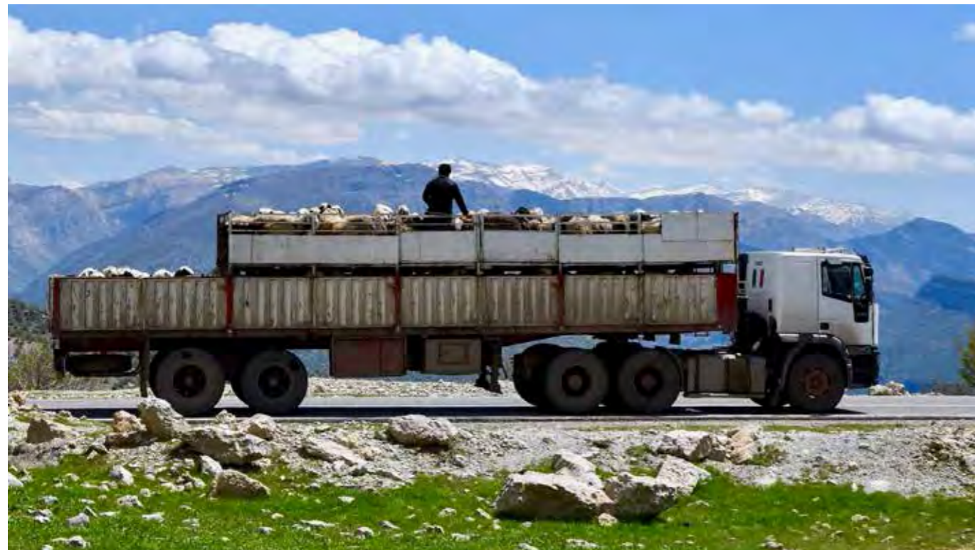
Left, top: Nowadays, those who can afford load their flocks and belongings onto a truck to overcome the 200 miles within two days