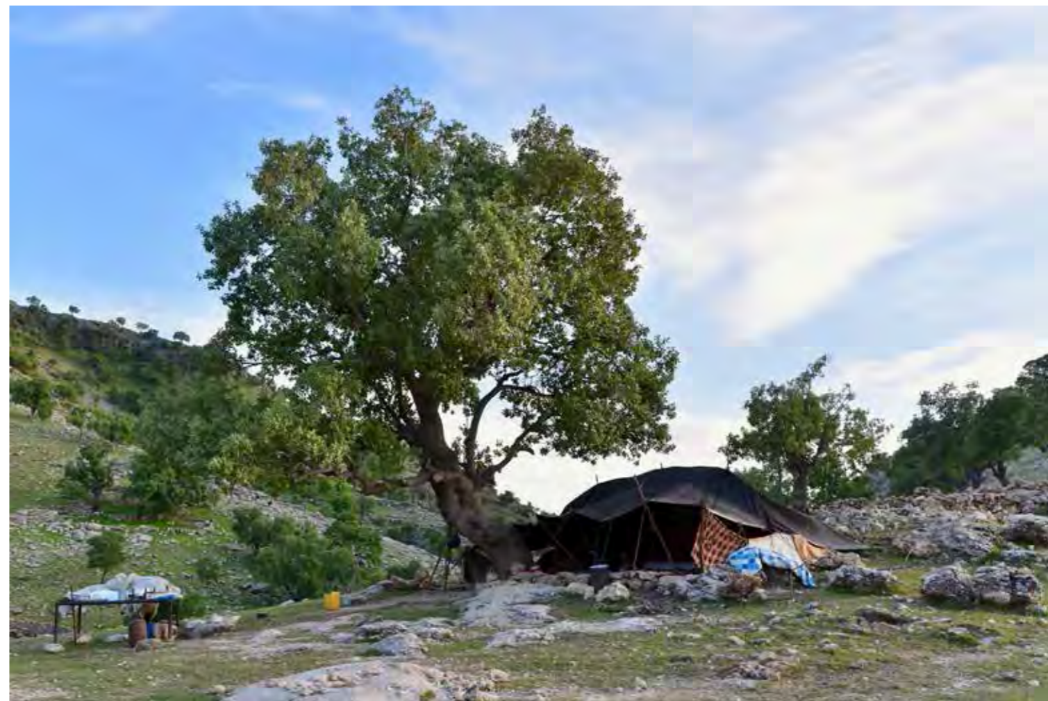
Above: A nomadic tent, traditionally made of woven wool and protected from wind and sun by a magnificent oak

this time with sound and color. However, the film mentions that there are already roads on which family members and their moving goods can reach the new grazing grounds. Almost 100 years later we follow the footsteps of the filmmakers. Our aim is to get an idea of how the nomadic life of the Bakhtiari has changed since the first film portrait.